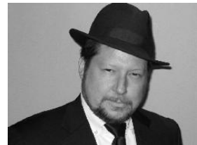
Sir LIONEL TROUT