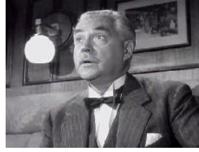
Colonel HORACE THUNDERBLAST